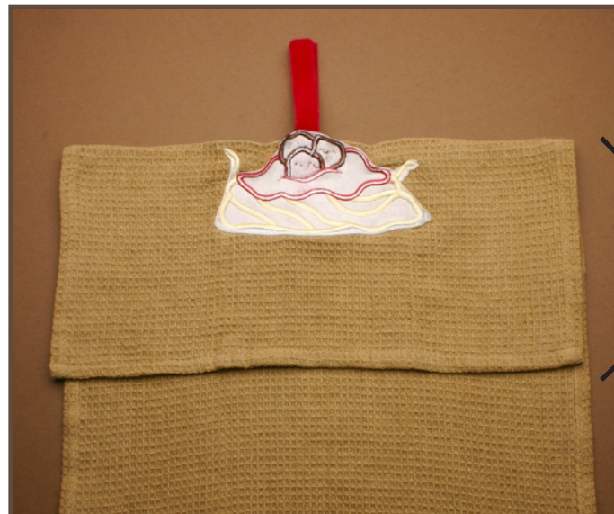
Example: Back of towel shown folded in thirds